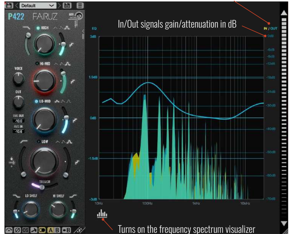
EQ bands & frequency spectrum visualizer

Input & Output signals in their respective colors.