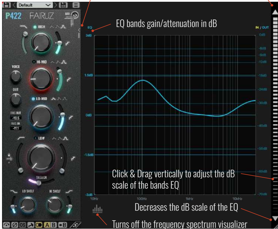
EQ bands visualizer

Input & Output signals in their respective colors.